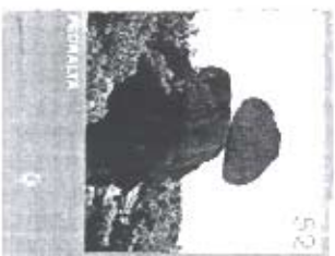
PEDRALTA SANT AMANÇ